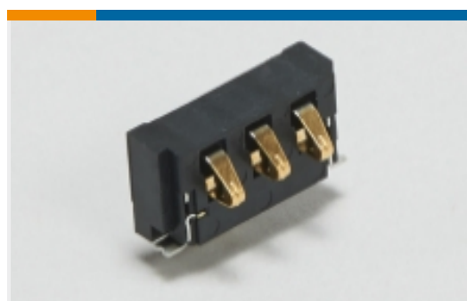
DC Jack Connectors(1)